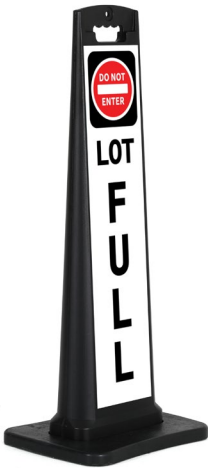
Do Not Enter with Lot Full on two sides