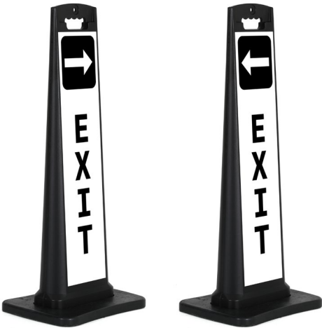
Exit Right Arrow on one side Exit Left Arrow on other side