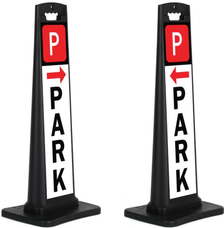
Park Right Arrow on one side Park Left Arrow on other side