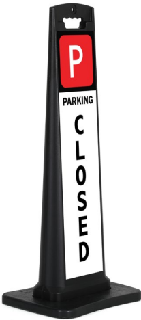
Parking Closed on two sides