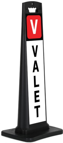
Valet on two sides