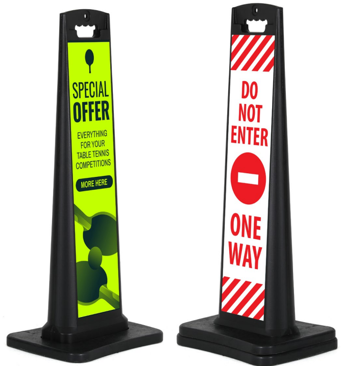
Single 6 kg / 13.23 lbs