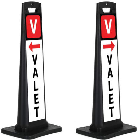
Valet Right Arrow on one side Valet Left Arrow on other side