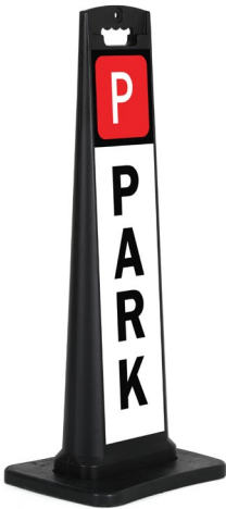
Park on two sides