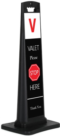
Black Valet Stop Here on two sides