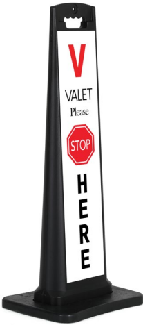
White Valet Stop Here on two sides