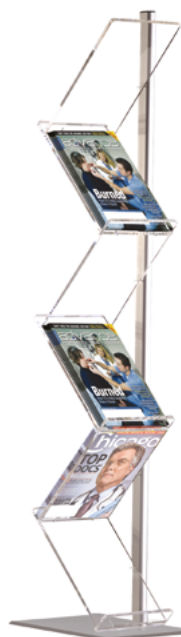
Single Leg Zick-Zack