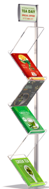
Single Leg Zick-Zack with Header