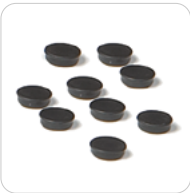
Optional magnetic buttons. Packed in 10. UYUP397000