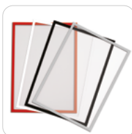
Magnetic PET Cover Please don't forget to order