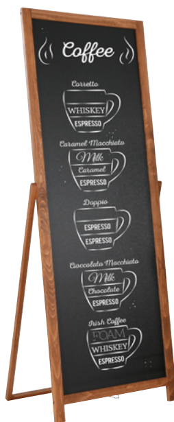
17.32" X 30.31"