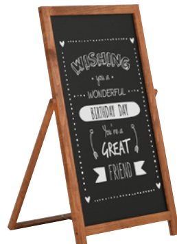
17.32" X 53.94"