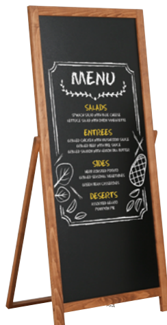
17.32" X 40.16"