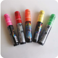
Colour chalkboard marker. 0.39" wide. 5 Pcs. / UYAKLM1251