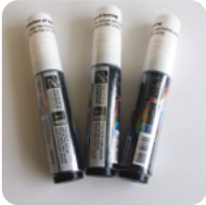
White chalkboard marker for Wood Display. 0.39" wide. 3 Pcs / UYAKLM1250