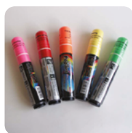
Colour chalkboard marker. 0.39" wide. 5 Pcs. / UYAKLM1251