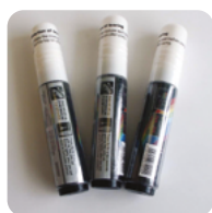
White chalkboard marker for Wood Display. 0.39" wide. 3 Pcs / UYAKLM1250