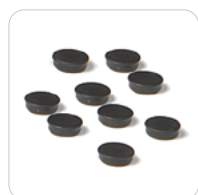
Optional magnetic buttons. Packed in 10. UYUP397000