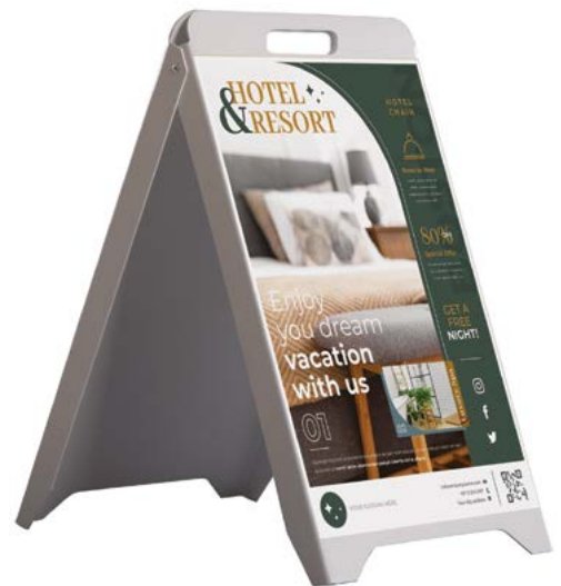
Carry PS Board