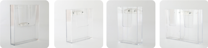
8.5" X 11" Acrylic shelf with connector. 5.5" X 8.5" Acrylic shelf with connector. 1/3 8.5" X 11" Acrylic shelf with connector. 2 x 1/3 8.5" X 11" Acrylic shelf with connector.