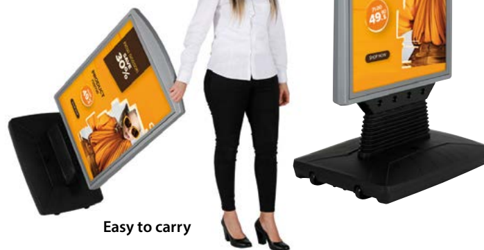
Easy to carry